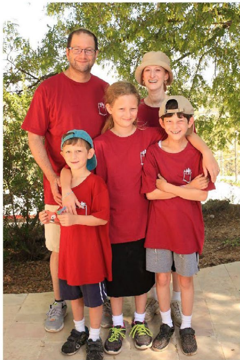
(Triathlon circa 2017)

It's bittersweet to say "see you soon" to all of our family and friends, parting from the place we called home for so long and the close relationships and support we have known so well. We are excited to begin this new chapter in our lives, hoping to continue and grow our connections with you all, but especially looking forward to seeing everyone in Eretz Yisroel shortly!!